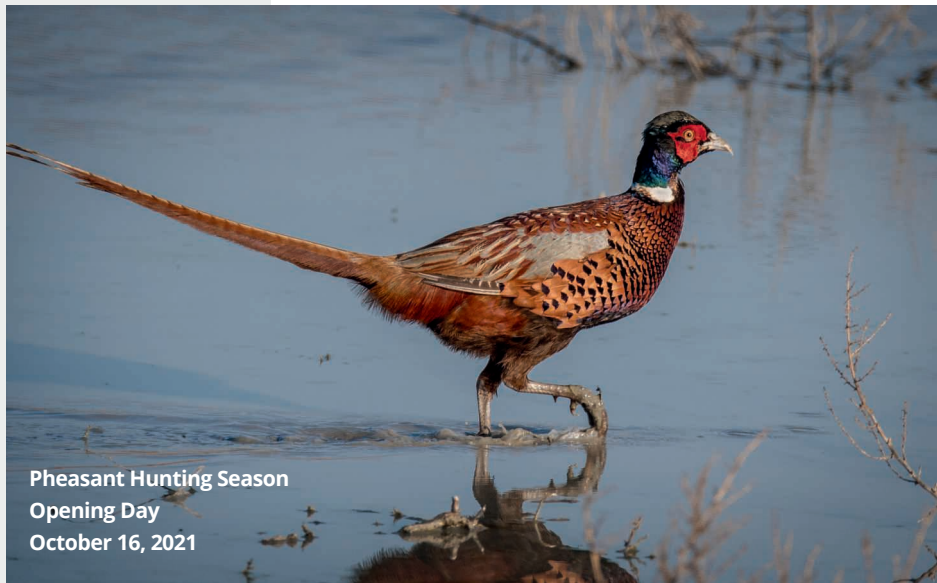
Pheasant Hunting Season Opening Day October 16, 2021

To have your event listed on this page, send complete information, including date, event, place and contact to your local electric cooperative. Include your name, address and daytime telephone number. Information must be submitted at least eight weeks prior to your event. Please call ahead to confirm date, time and location of event.